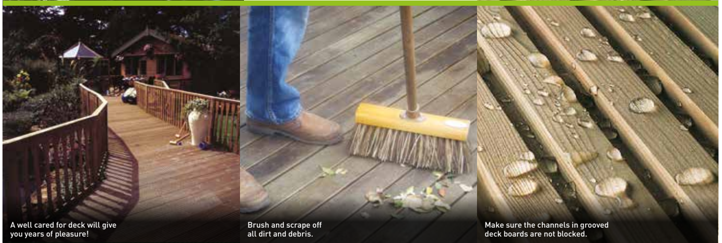
A well cared for deck will give you years of pleasure!