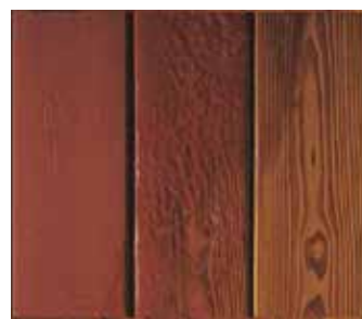
Strip off any old coating before redecorating the deck – you might like the look of the wood you reveal.

CAUTION: take care when using a pressure washer so as not to damage the surface of the deck. Don't use the lance too close to the deck surface and set the pressure to the minimum level. Alternatively, use an attachment especially designed for cleaning decks but still exercise caution and keep the head moving to avoid causing damage.