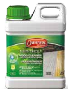
Specialist deck cleaners are available - check out our website for supplier details.