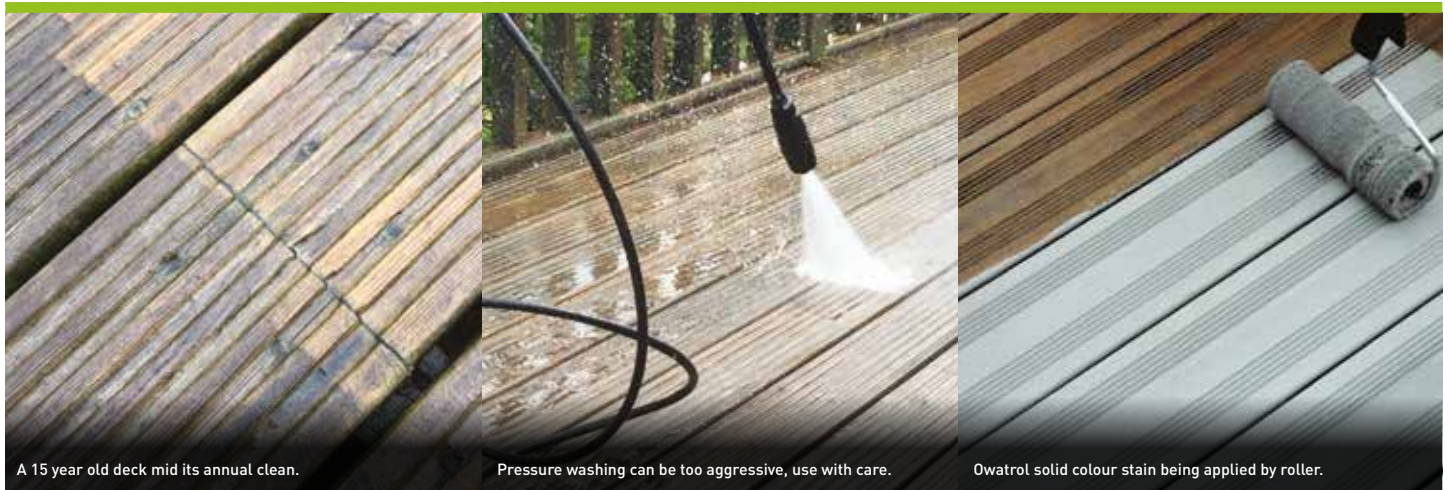
A 15 year old deck mid its annual clean.

Now put your feet up, sit back and admire the results!